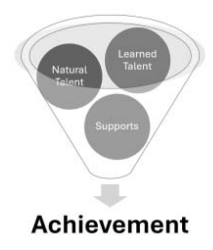
Figure 1 From Talent to Success

Each individual is born with a unique constellation of natural talent across various domains. For instance, a child who creates intricate and imaginative drawings or sculptures may possess an innate talent for visual arts. Likewise, a child who easily learns to play musical instruments or creates original songs may have a natural talent for music. This broader perspective, supported by Gardner (1983) and Goleman (1995), emphasizes that natural talent should be defined not just by traditional academic performance but by recognizing and valuing a diverse range of abilities.